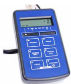
TR150 Handheld Indicator