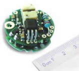
ICA Miniature Strain Gauge Amplifier