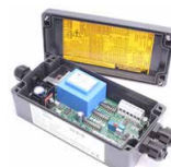
SGA Signal Conditioner/Amplifier