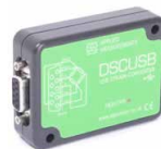
DSC-USB USB Signal Digitiser