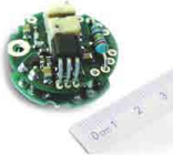
ICA Miniature Strain Gauge Amplifier