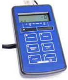
TR150 Handheld Indicator