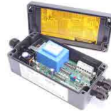
SGA Signal Conditioner/Amplifier