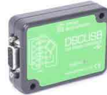
DSC-USB USB Signal Digitiser